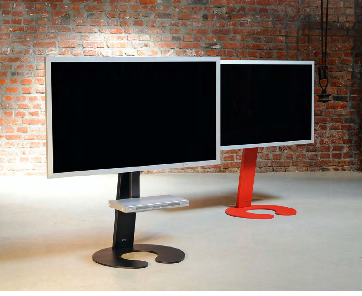
> art 111-r