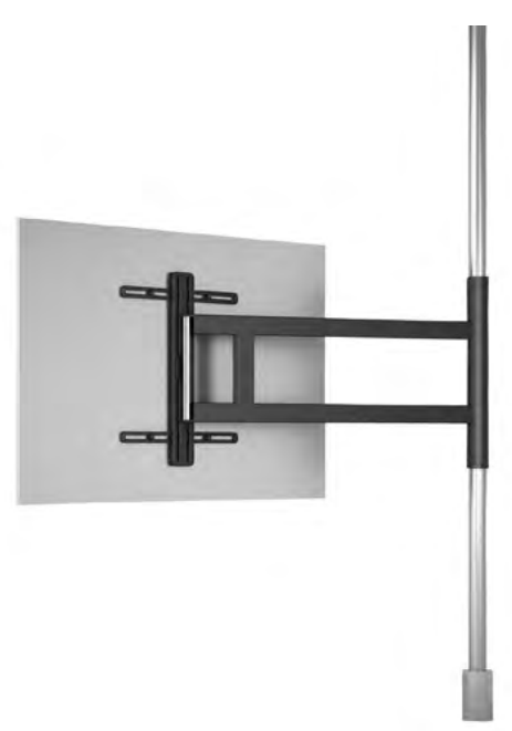
> option: double arm in desired length for large or heavy TV sets