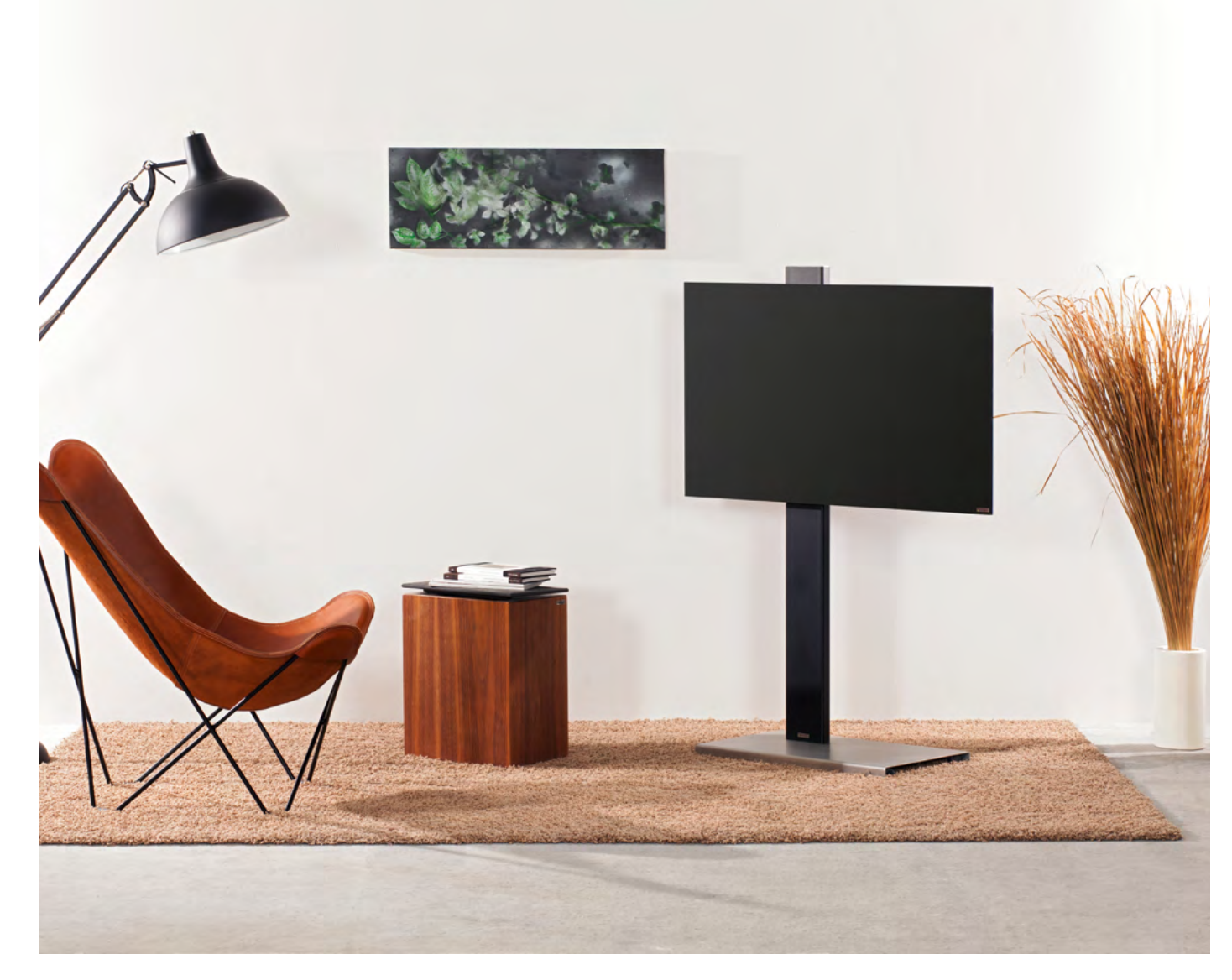
> art 118-s