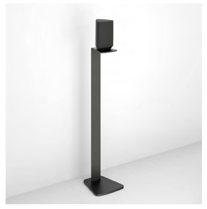
> flat art142-1 > flat art142-2